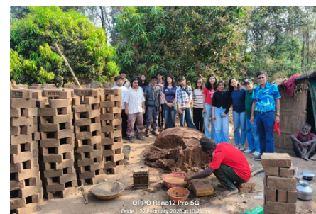
visit to Brick factory